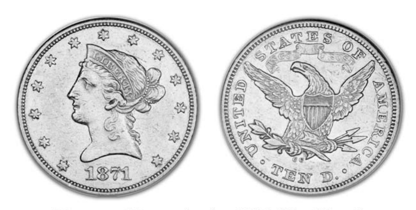
A lustrous AU example of an 1871-CC gold eagle.

is greatly undervalued at its current price structure. I would expect increases in the price of the 1871-CC eagle with renewed interest in gold coinage from collectors.