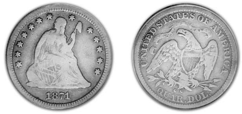
A lovely circulated example of the very rare 1871-CC quarter.

The 1871-CC quarter has the highest price in all of the listed grades for the seven denominations. This is mainly due to the pressure created from set collectors in the quarter series who would