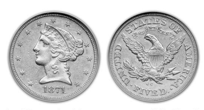
An AU example of the very rare 1871-CC half eagle.

No prices are given for the gold denominations in VG because gold coinage is usually not collected in this grade. Most gold coins sold in the current market are in grades of VF and above, so this presentation will focus on these grades. The 1871-CC half eagle is a very scarce coin, but it is listed at only $3,250 in VF, a fraction of the value for a dime, quarter, or silver dollar in this grade. Demand for this coin comes mostly from Carson City coin specialists, since there are very few set collectors of Coronet gold coins due to a long list of rare and expensive issues. Prices for rare date gold coins have remained